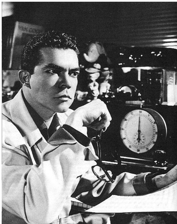
[Juan García Esquivel]