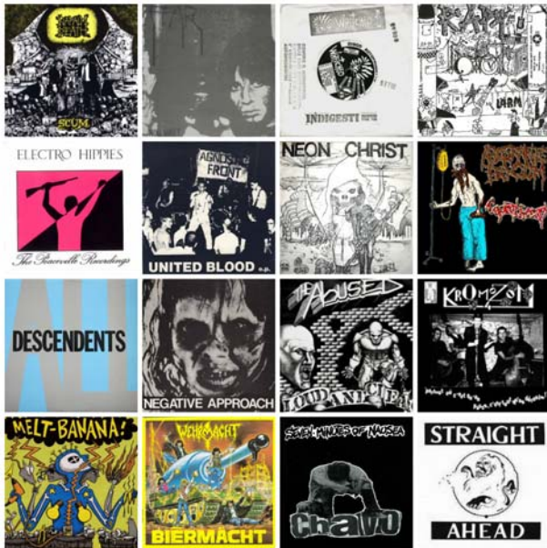
[Some of the record covers that Dave Phillips used in this INTERRUPTIONS"]

Short-term and long-term perception within the same time-frame with strongly differing results regarding effects affected.