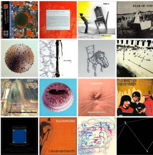
[Some of the record covers that Dave Phillips used in this INTERRUPTIONS"]