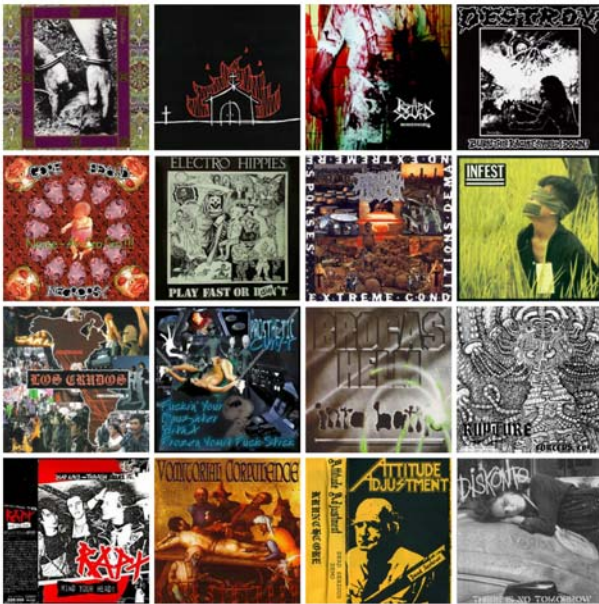
[Some of the record covers that Dave Phillips used in this INTERRUPTIONS"]