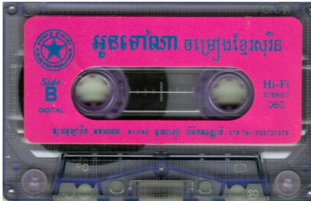
[Mark Gergis' sound collection]

Arab world and Southeast Asia have been captivating enough for me to spend the last two decades listening and collecting.