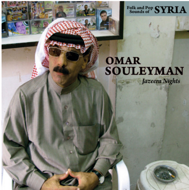
[Omar Souleyman Jazeera Nights , 2010]

sound in the region, or by Sony or Time/Warner Asia – big time industries that have moved in on the market and profit considerably from it. The result is a market that dictates the sound and makes it near impossible for any sort of inspired new life to appear on the scene, with few exceptions, unless it is deemed fit to sell by the industry. A regional folk-pop music machine in Northeast Thailand exists and has been seen as a commodity niche market with the moguls in Bangkok for a good 40 or 50 years. As a result, Bangkok has often been the maker or breaker of Molam and Luk Thoong regional music from the rural northeast.