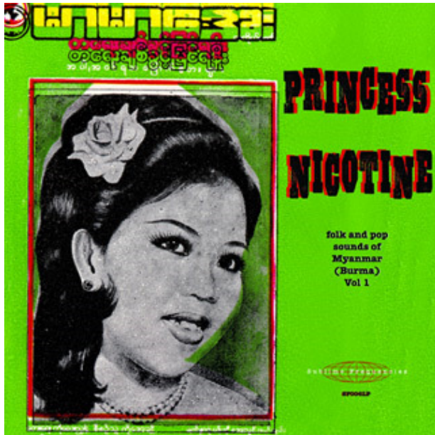
[Princess Nicotine Folk and Pop Sounds of Myanmar (Burma), 2004]

Regarding the political nature of releasing, I always think the politics are inherent in the releases on a case-by-case basis. Being part of a label that issues music from Syria, Egypt, Lebanon, Palestine and Iraq, and even other parts of the world, for me, has always been political. We don't necessarily wrap the discs in political packaging or get any more pedantic than we need to in the liner notes, but for anyone who's guessing, the politics are apparent. Together with the folks at Sublime Frequencies, I'm also outspoken in interviews, where our politics are usually made clear.