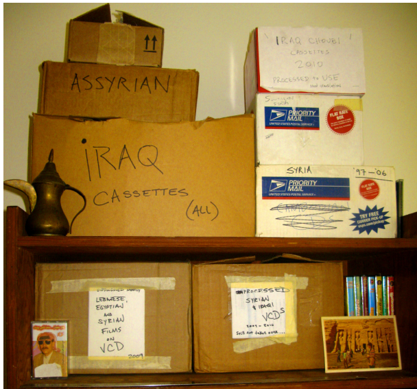
[Mark Gergis' sound collection]

I now own thousands of vinyl records, cassettes, CDs, VCDs, DVDs, MP3s, etc. Honestly, I stopped counting a decade ago. I have them all meticulously labelled by geography, style, sometimes regionally. I have numbering systems for all of them. The ones that aren't in a script I can understand get scanned for future translation. I have favourites of all kinds from every region and not one single item that stands out as a prize, or anything. Instead, there are some standout anomalies that are precious to me. These can be musical anomalies, cover design/art anomalies, or related to something that I thought I'd never be able to find – or didn't know existed.