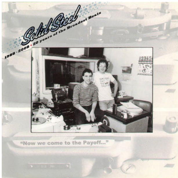
[Double Dee and Steinski]