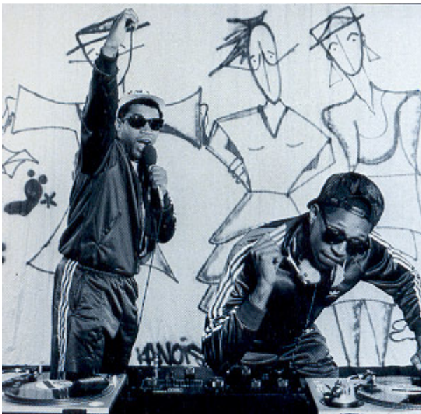
[World's Famous Supreme Team]