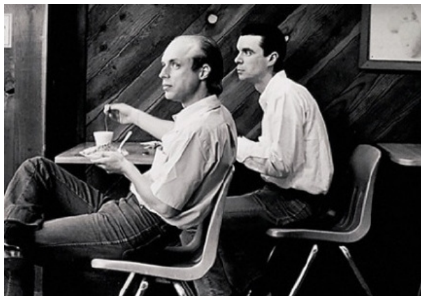
[David Byrne and Brian Eno]