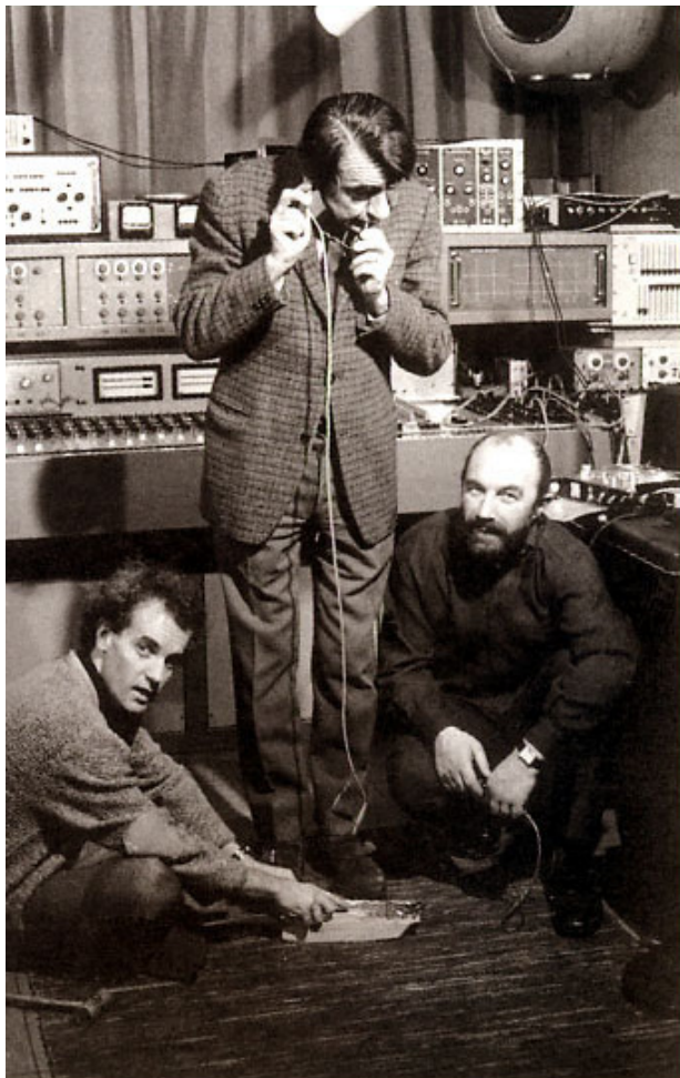
[François Bayle, Pierre Schaeffer, Bernard Parmegiani]

Every effort has been made to trace copyright holders; any errors or omissions are inadvertent, and will be corrected whenever it's possible upon notification in writing to the publisher.