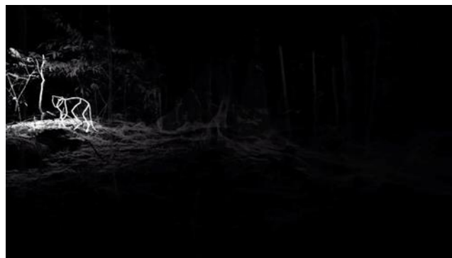
A Dream Dreaming a Dream, 2020