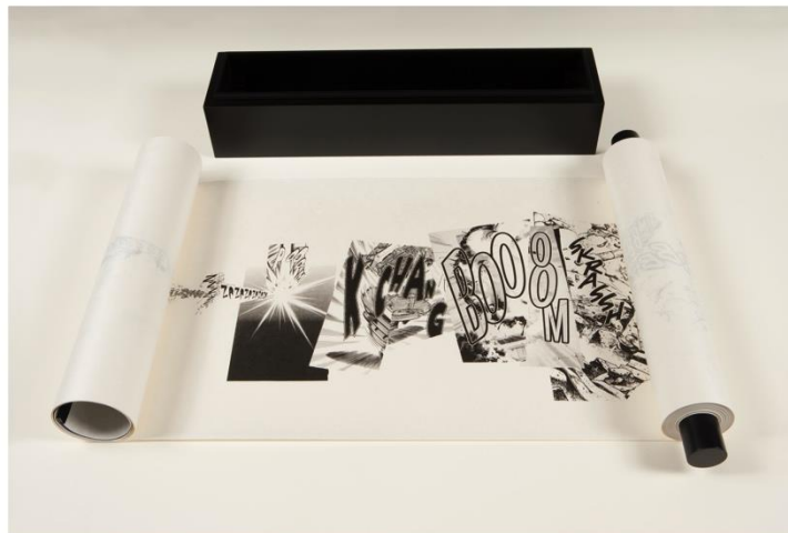
Christian Marclay Manga Scroll , 2010, lithographic hand scroll 16 x 787 1/2 in. (40.6 x 2,000.3 cm) © The artist.

This exhibition is the first for over a decade in Spain devoted to the Swiss-American artist Christian Marclay (b. 1955), who currently lives and works in London, and will include a selection focusing on his sonic compositions, from graphic scores to video installations. Marclay has consistently focused on the relationship between sound and vision, exploring the ways that sound can be manifested visually. As the artist himself said, 'music runs through almost everything I do'.